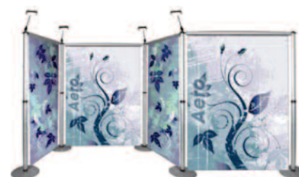
The display can be expanded by linking kits together