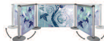
Banners can be positioned in multiple angles

Aero is a smart and extremely versatile modular display system that is very easy to transport and assemble, making it ideal for all types of display application.